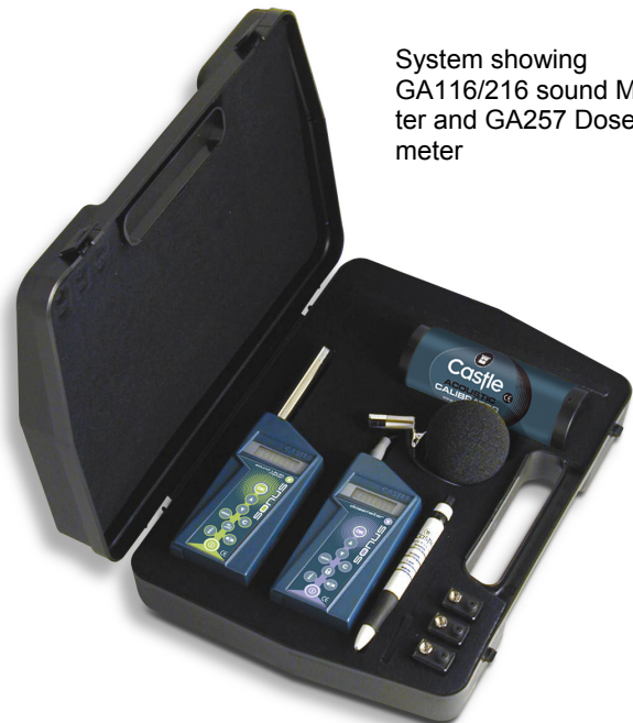
System showing GA116/216 sound Meter and GA257 Dosemeter