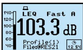
Main result in one-profile view

**with USB 1.1 Host function not active and backlight off